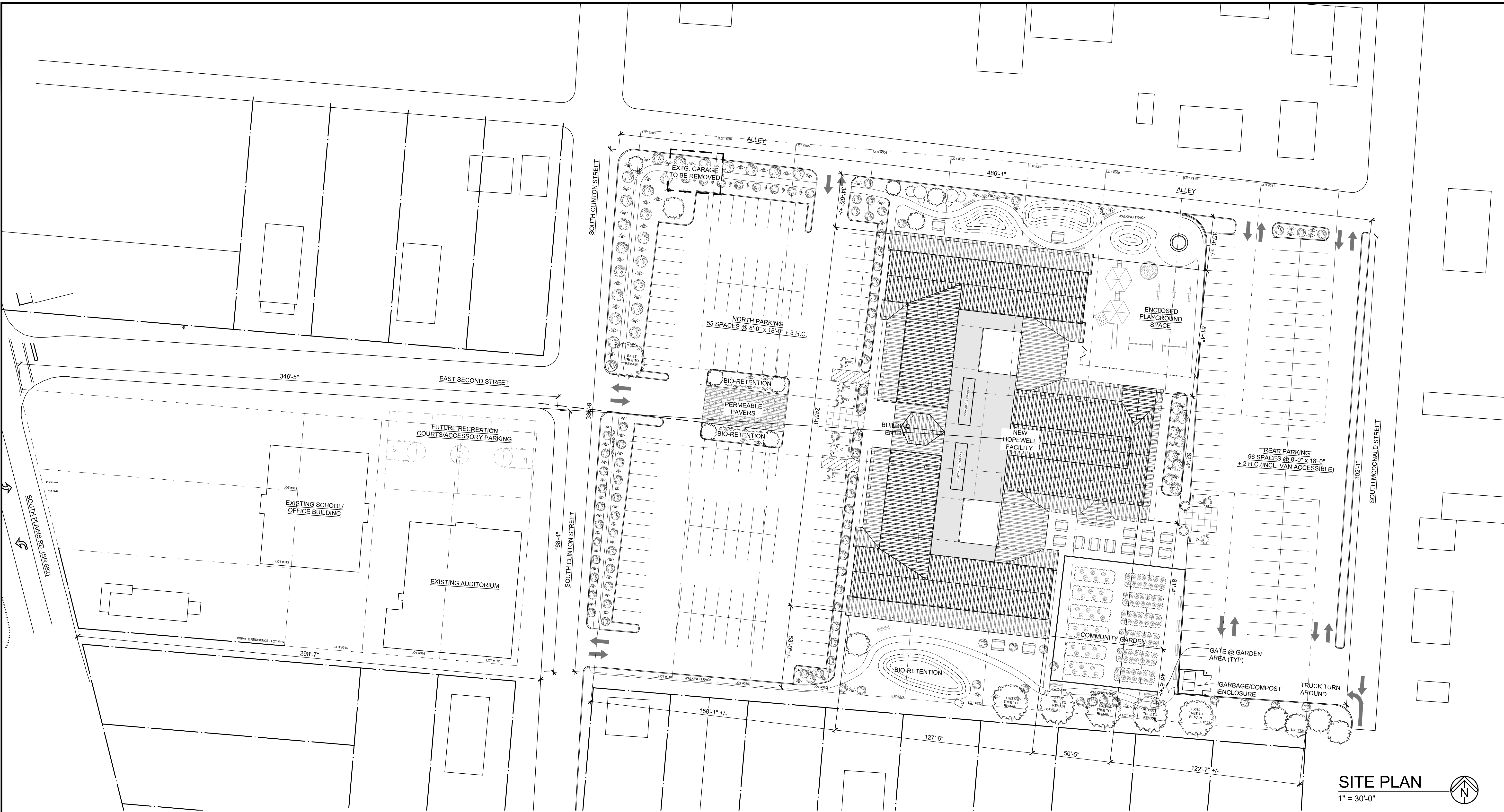
SITE PLAN 1" = 30'-0"